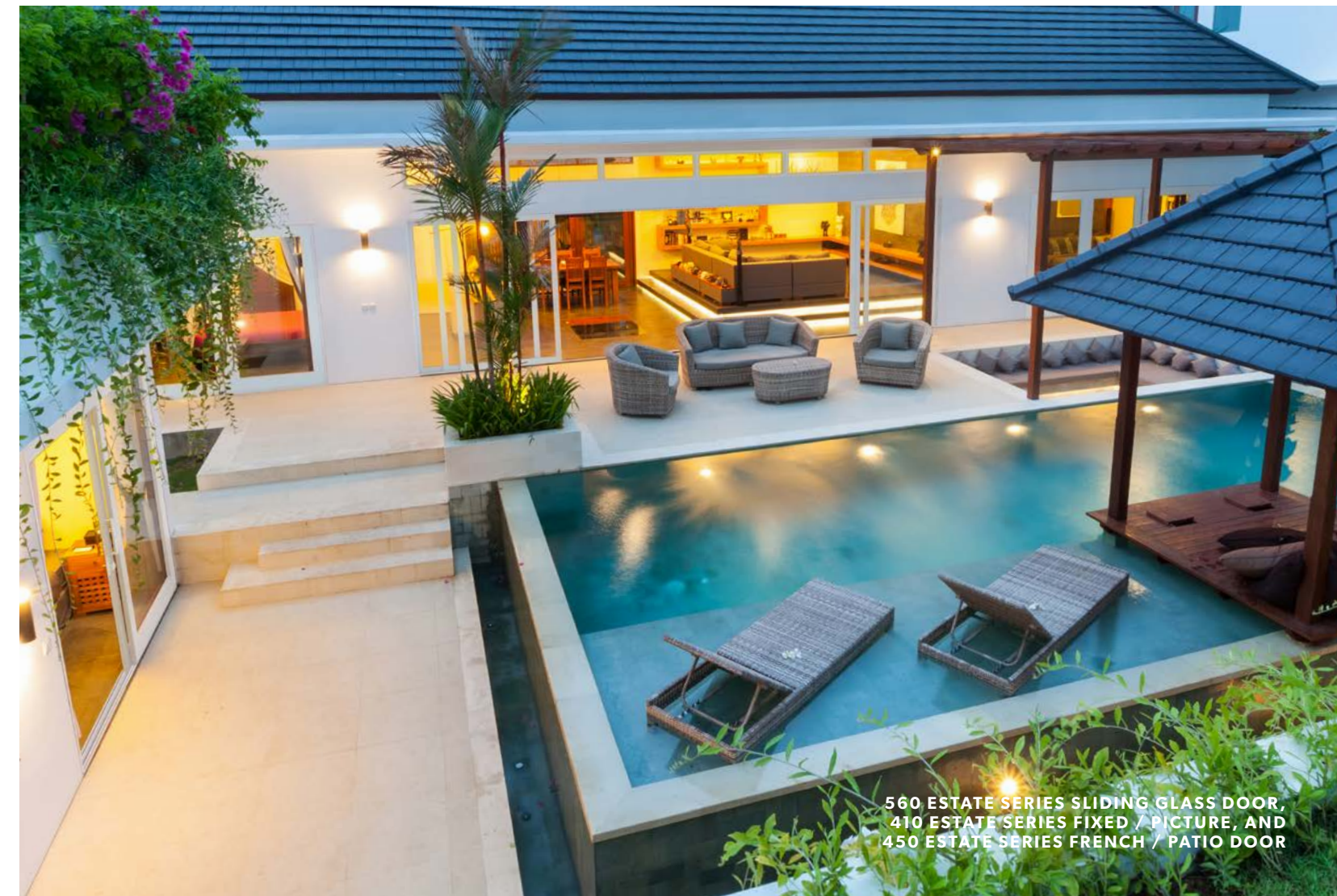
560 ESTATE SERIES SLIDING GLASS DOOR, 410 ESTATE SERIES FIXED / PICTURE, AND 450 ESTATE SERIES FRENCH / PATIO DOOR